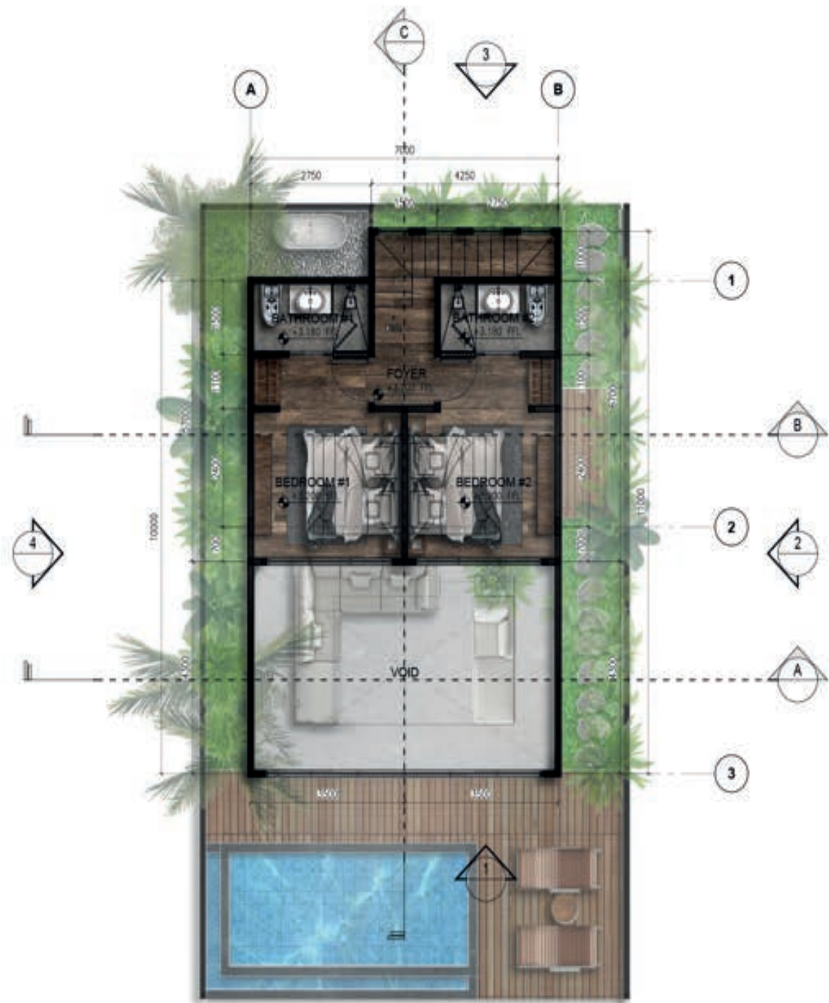
TWO BEDROOMS 1ST FLOOR PLAN SCALE 1:100