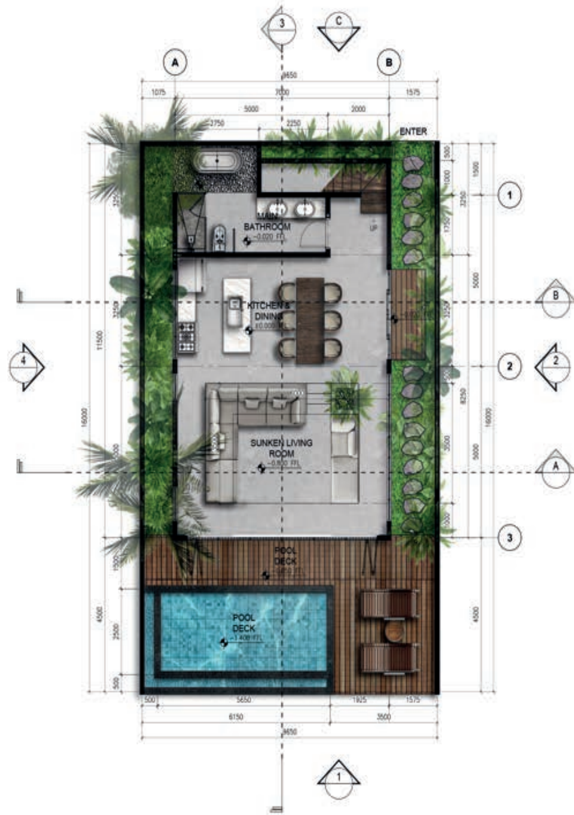
TWO BEDROOMS GROUND FLOOR PLAN SCALE 1:100